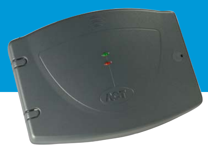
ACT pro IOM