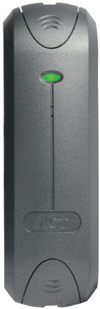
Product Code ACTpro MF 1030e Mullion Proximity Reader

1030e, 1030PM, 1040e, 1050e & USB Reader