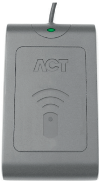
Product Code ACTpro USB Reader USB MIFARE Reader