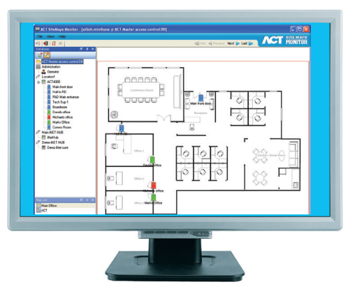
ACT Site Maps