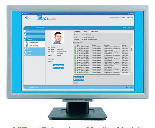
ACTpro Enterprise - Monitor Module